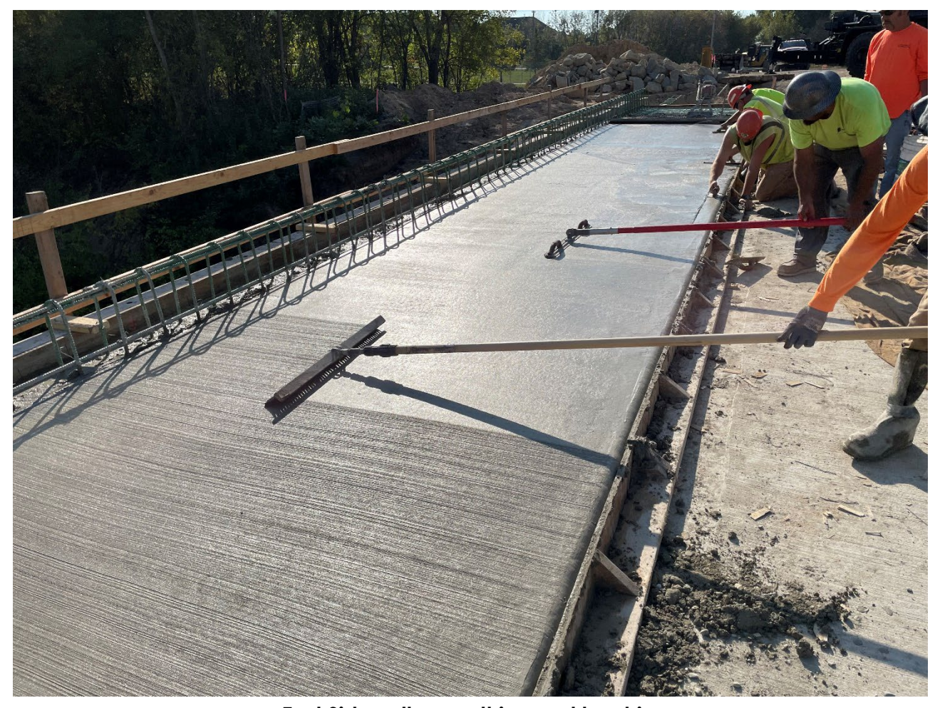
East Sidewalk smoothing and brushing