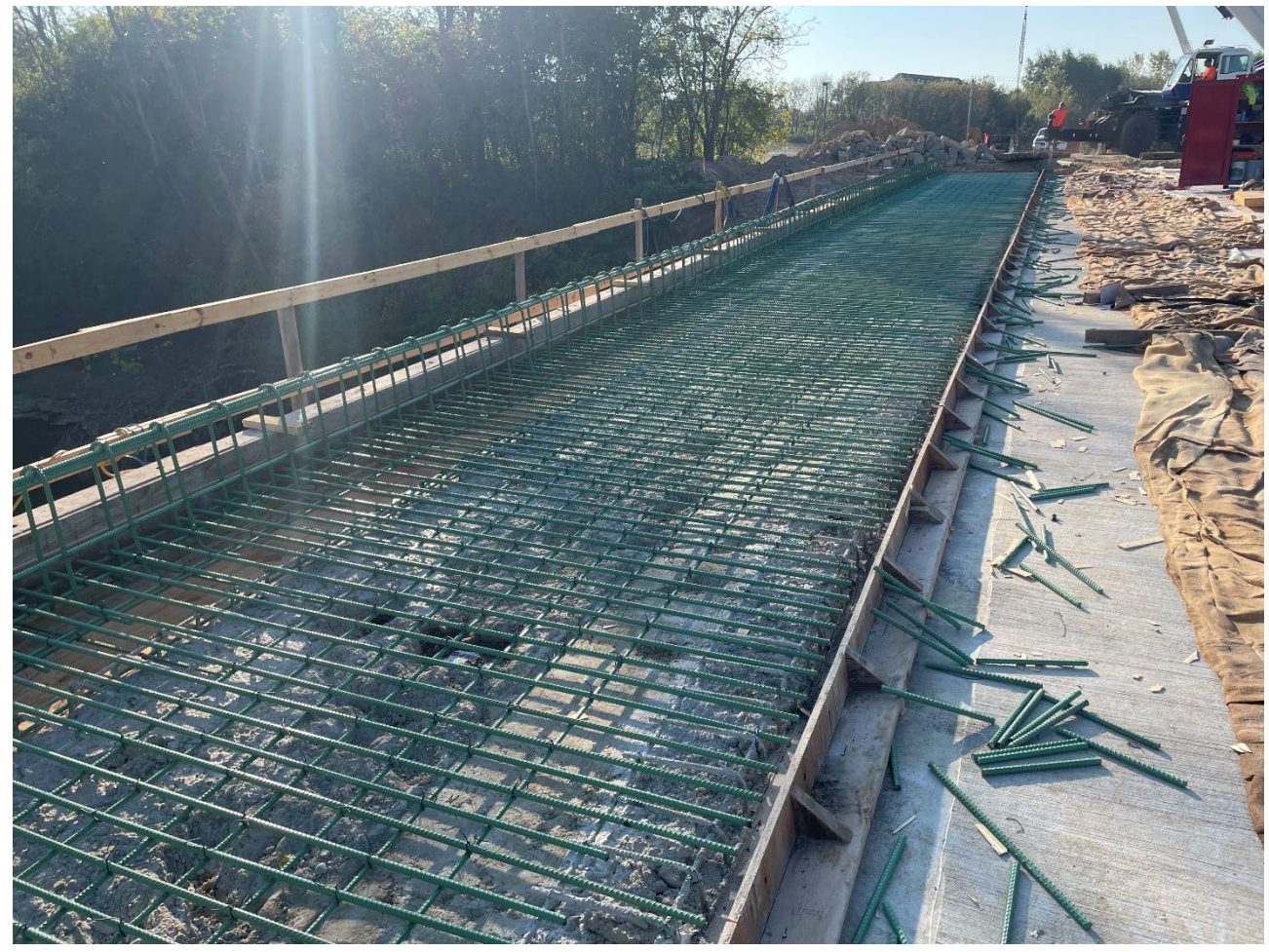
East sidewalk steel reinforcement and formwork