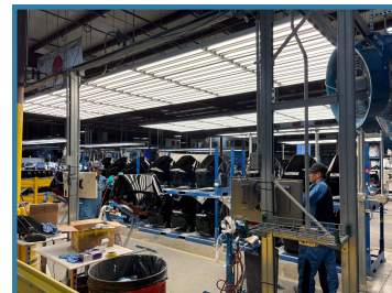
MasterMold Employees Putting the Finishing Touches on a Mercury Marine Engine

More and more MasterMold employees are choosing to live in Johnson Creek, with new residential developments helping to support this trend. The company also stays active in the community by supporting ground-level causes such as the public library, Nickel Night and donating to the American Flag project at Centennial Park, while encouraging employees to enjoy local restaurants, events, and baseball games.