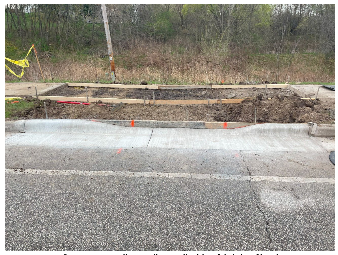
Ramp preparation on the south side of Aztalan Street.