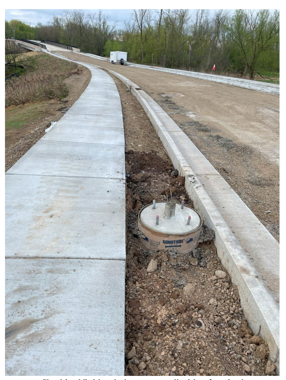
Electrical light pole base on north side of project.