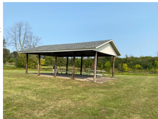
Pavilion at Pioneer Park.

Centennial Park is one of our largest parks, located along the Interstate near the Morse Farms subdivision, or near the intersection of Gosdeck Lane and Midge Street. Centennial Park is home to many baseball, softball, and t-ball activities, and it has a pavilion area with seating and concessions. You can often find families enjoying the playground equipment and using the