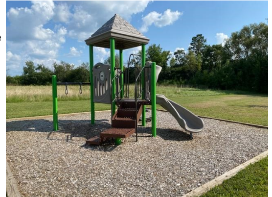
Playground at Crossroads Landing.

We've written about Crossroads Landing before, but there are still improvements happening in the park. Crossroads Landing was originally made possible by a state grant the Village received, but we have continued to dedicate resources since that time to improve amenities and enhance features of the park. There are bathroom facilities and a multi-use path that winds through the trees, stretching from Rainbow Lane all the way down to the canoe and kayak launch. At the launch, we've added a system to help safely launch a kayak and assist people of all ages and skill levels feel comfortable getting their craft into the water. Crossroads Landing is also our only pet-friendly park, so you can come enjoy the park with your leashed dog, bring the kids to the playground, and sit and enjoy the view of the water from the pergola which was handcrafted by a local Eagle Scout. This month the Department of Public Works is beginning a project to expand the current playground area with additional pieces of equipment.