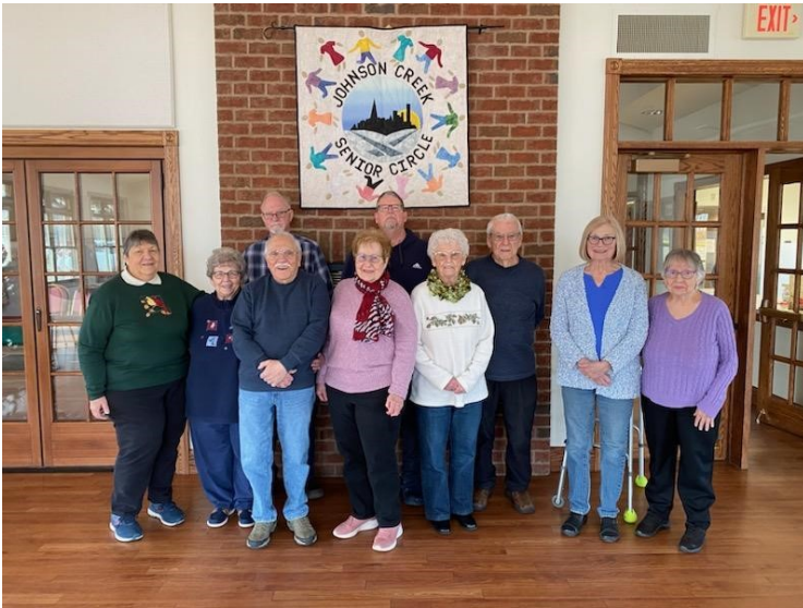
Members of the Johnson Creek Senior Club.