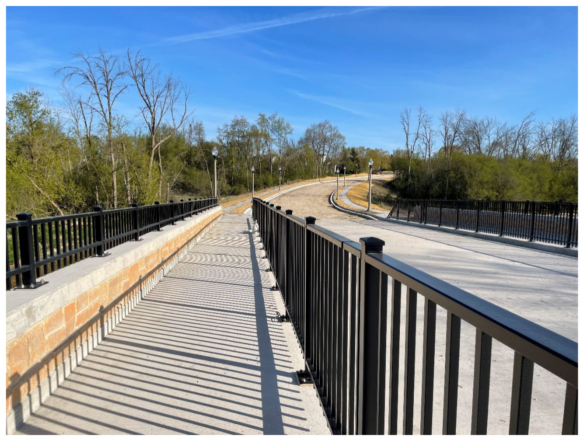
View from bridge of terracing and light poles.