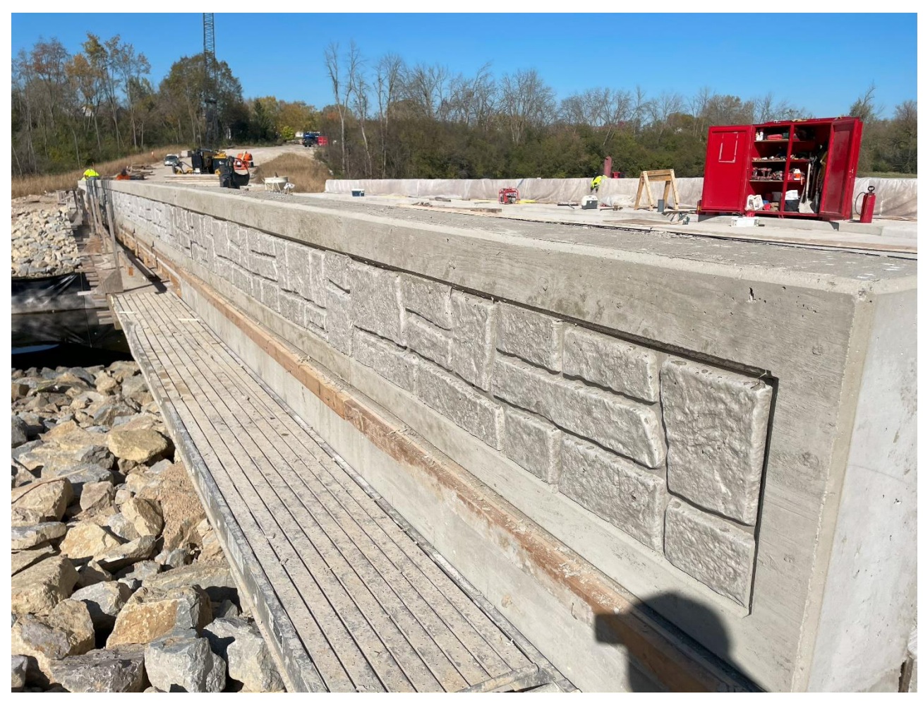
Parapet rock wall after sanding and grinding (touch up work and staining to occur in the spring).