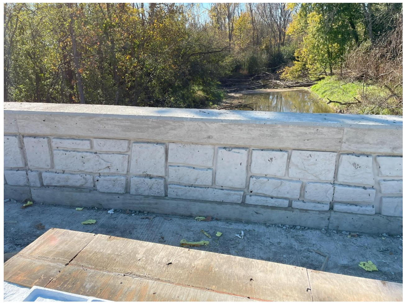
Parapet rock wall before sanding and grinding (touch up work and staining to occur in the spring).