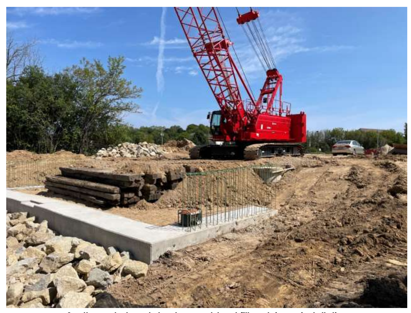
Southern abutment structure post-backfill and riprap installation.