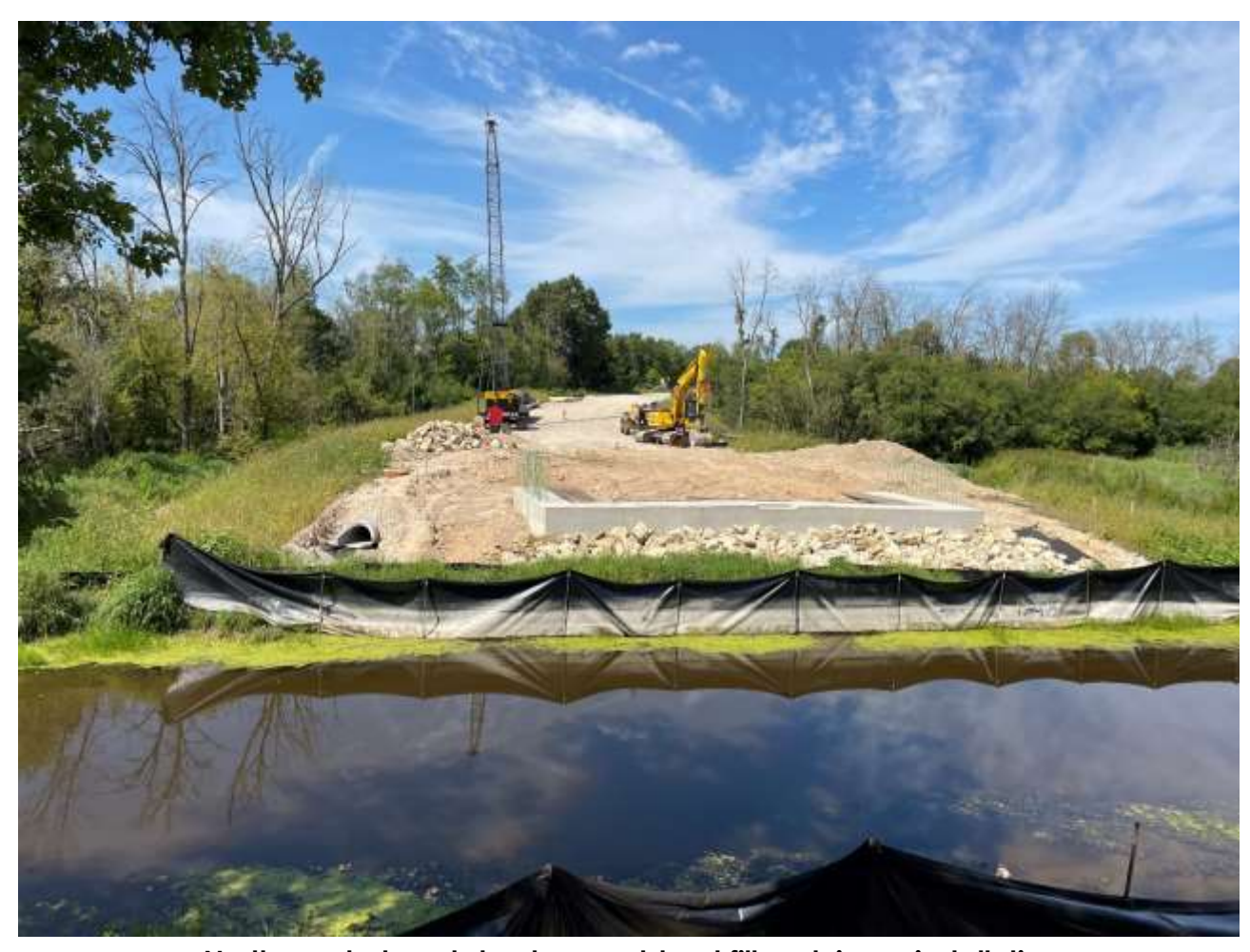
Northern abutment structure post-backfill and riprap installation.