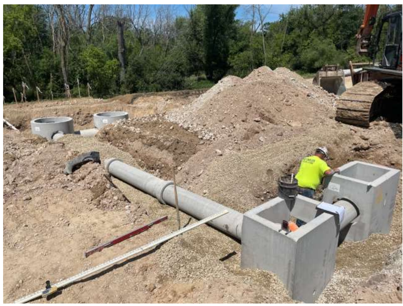
Storm sewer structure installation on the north end of the project.