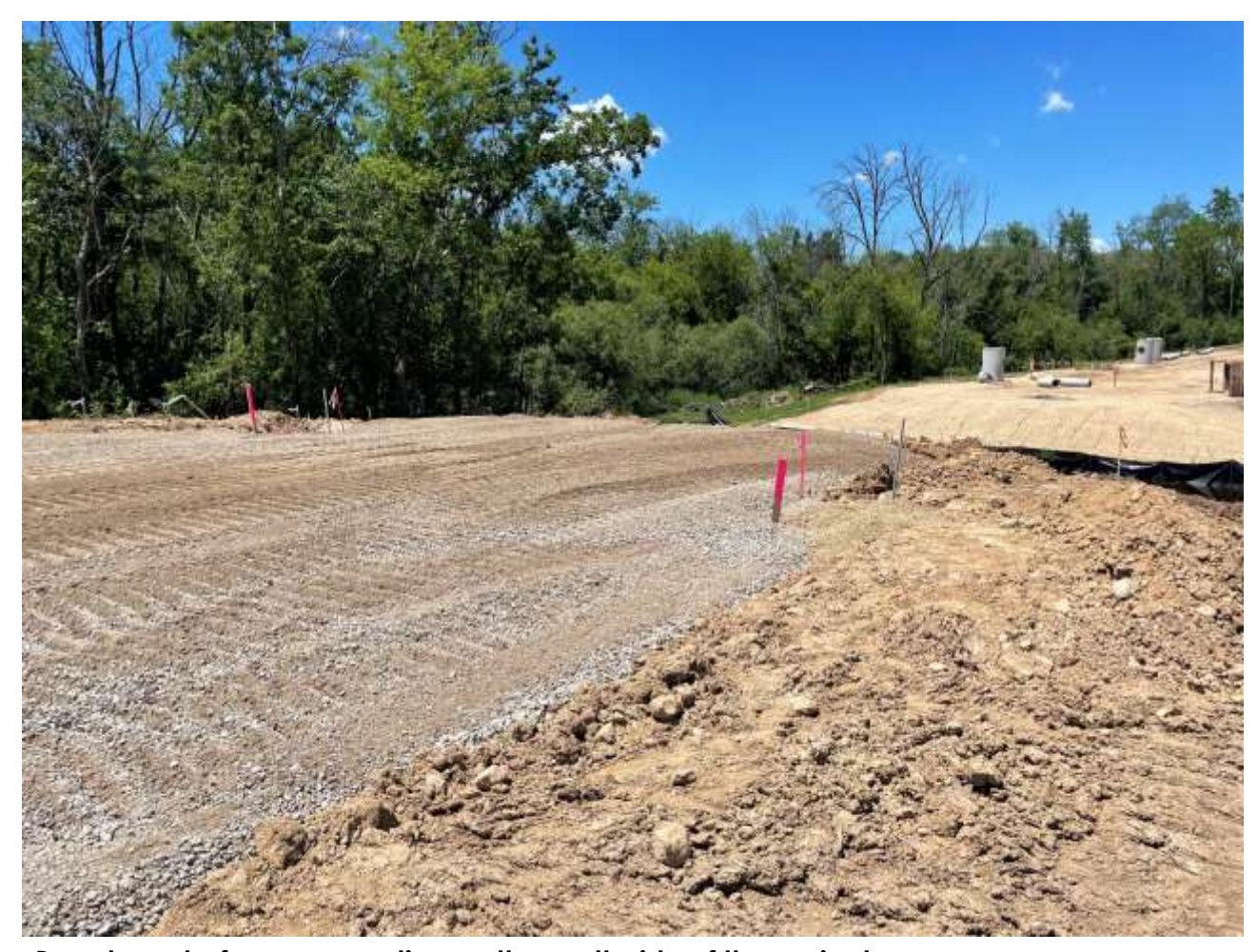
Base layer before compaction on the south side of the project.