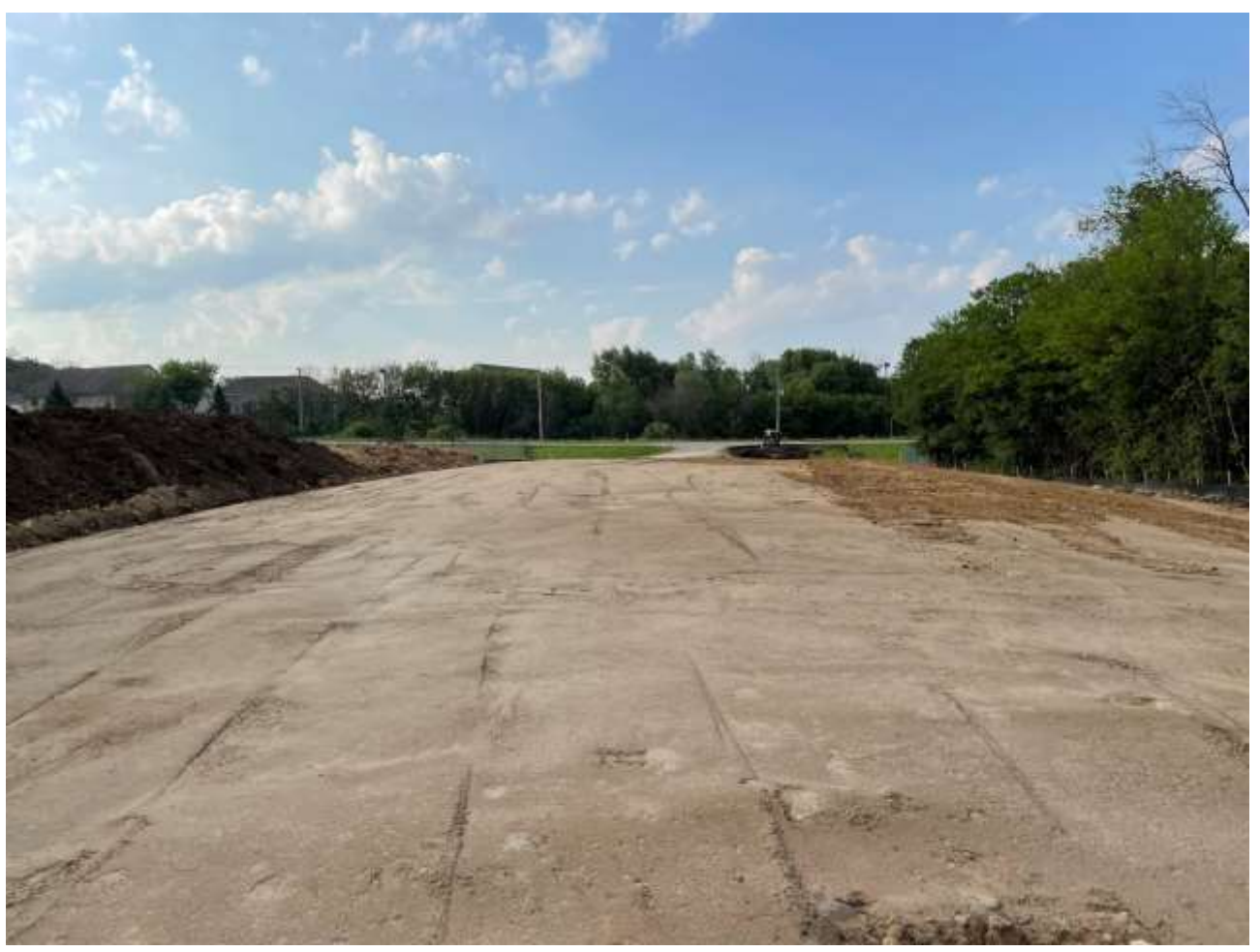
Applied borrow material on the southern end of the project.