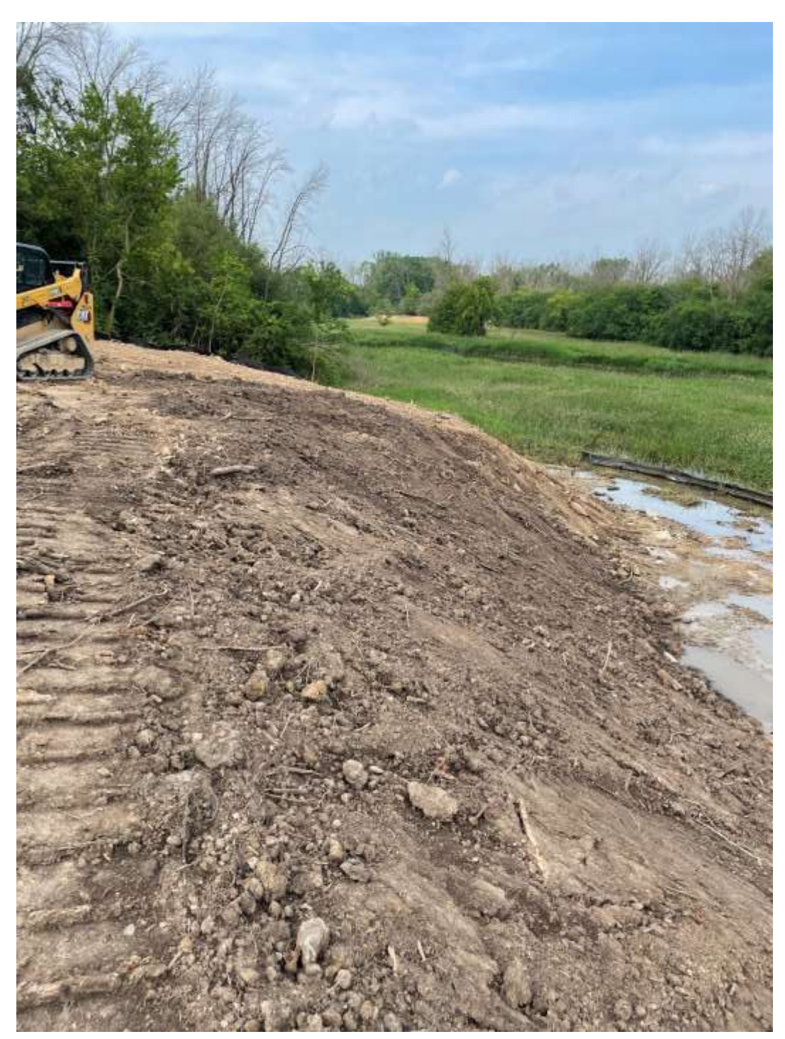
Excavated slope of the flood storage area.