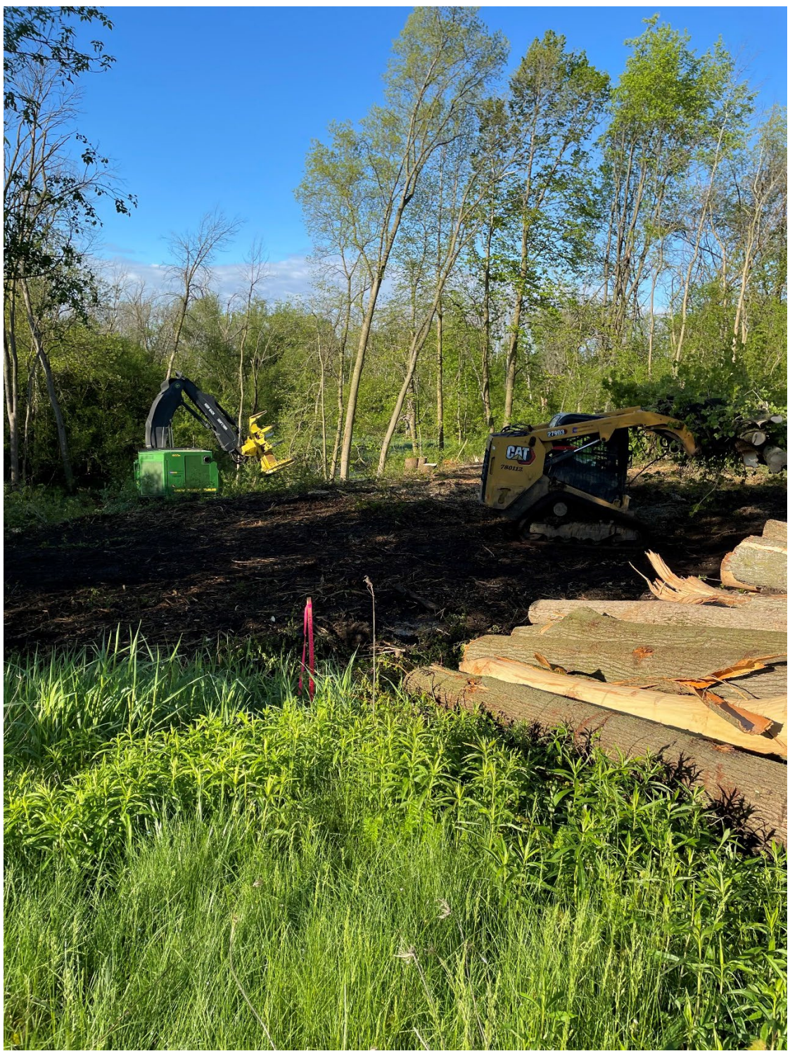
R.G. Huston clearing trees and vegetation in preparation for earthwork on the north portion of the project (south of Chapel Hill Drive).