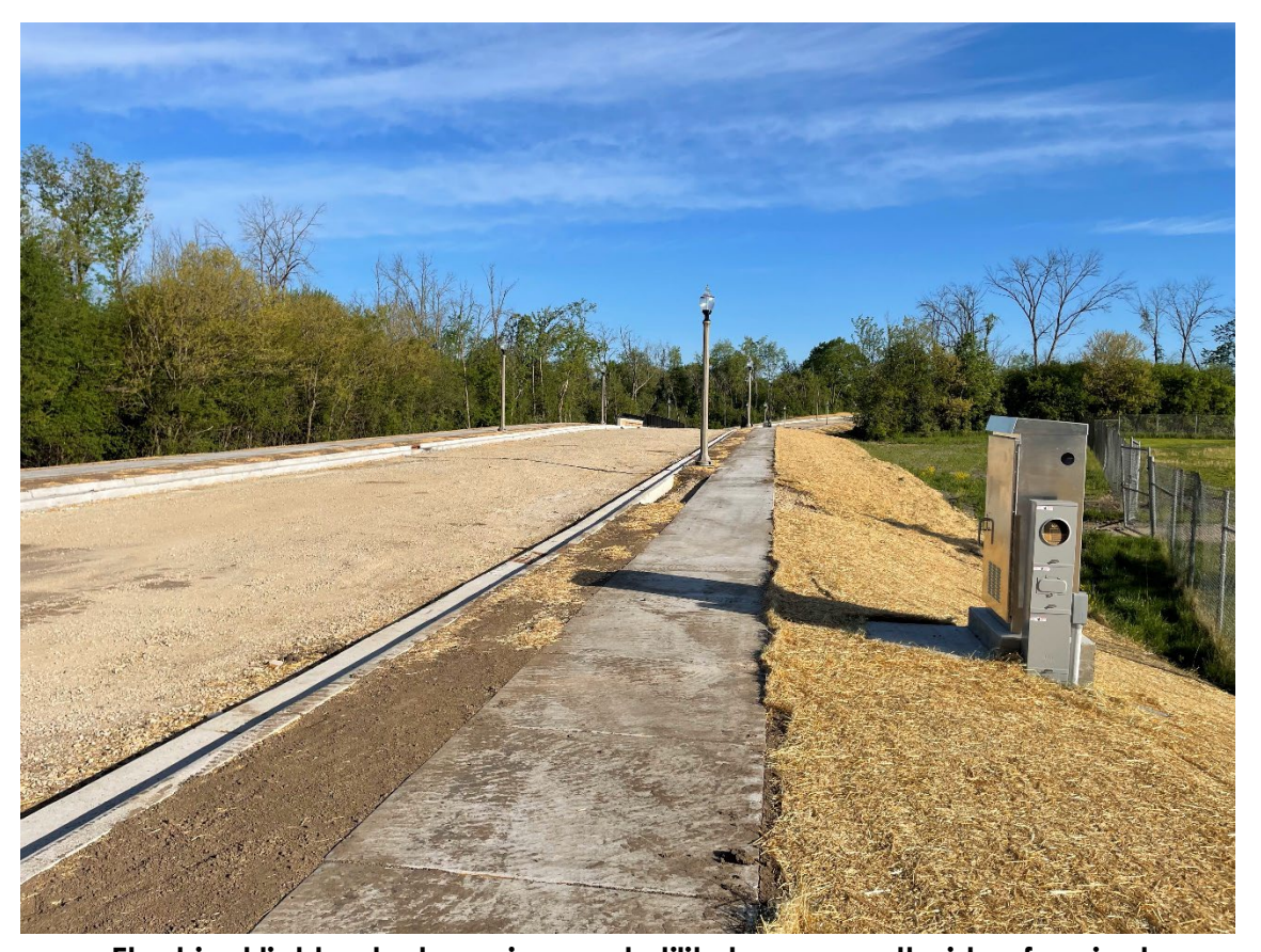
Electrical light pole, terracing, and utility box on south side of project.