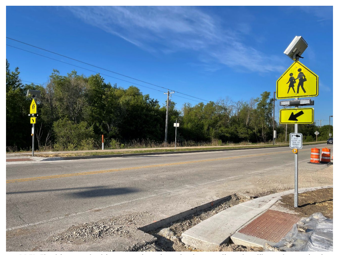
RRFB Flashing pedestrian crossing signs (not operational until road opening)